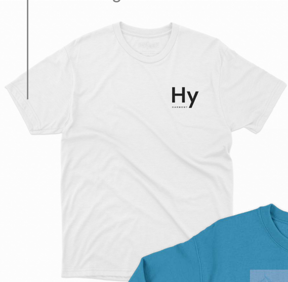
Tshirt design 1