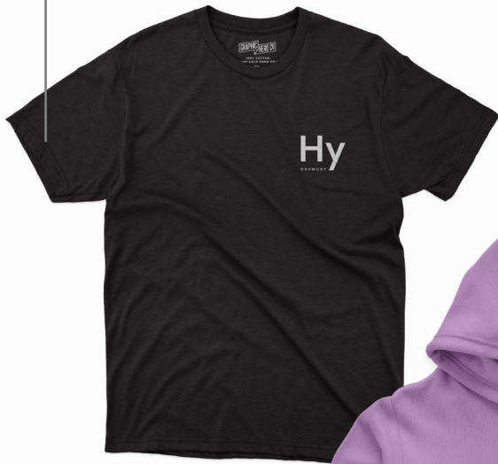
Trainee Tshirt design 1