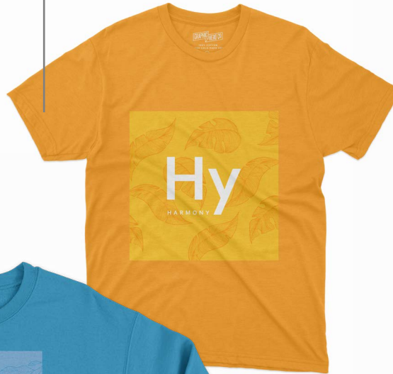
Tshirt design 2