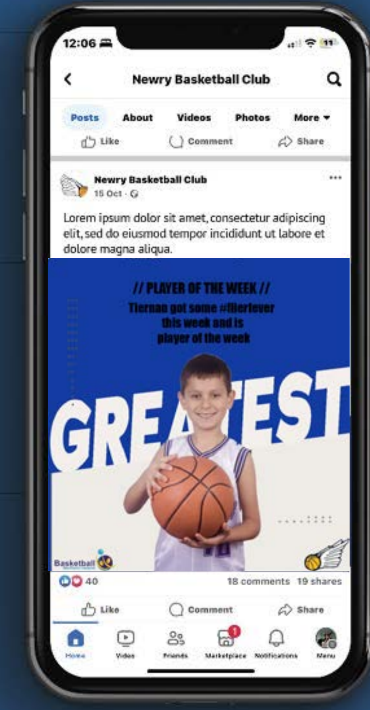
PLAYER OF THE MONTH